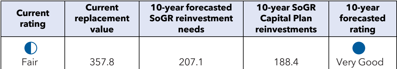
Table 1. Current state and 10-year plan (in $ millions)

Table 1 shows that the current overall infrastructure state for the Peel Police is 'Good'. The estimated replacement value of these assets is $357.8 million, based on 2023 values. The 10-year Capital Plan includes reinvestments of $188.4 million to maintain the infrastructure in a SoGR. These planned investments are aligned with the forecasted needs of $207.1 million over the same period.