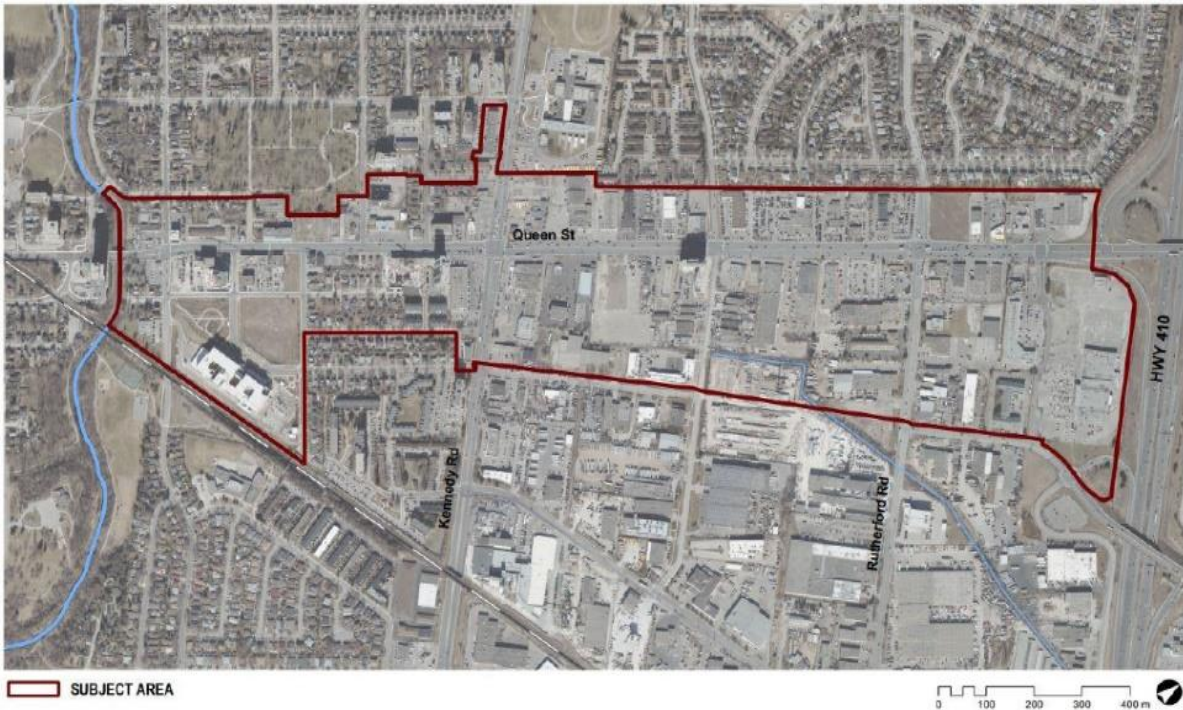
Figure 1: Proposed UHD Boundaries

The September 2022 Recommendation Report recommended that if UHD was to be implemented, it should be subject to the approval of several technical studies (e.g. servicing, traffic, growth management, urban design, shadowing) to the satisfaction of the City prior to the lifting of a Holding (‘H’) Provision.