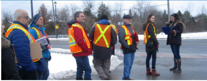
CWG neighbourhood walk