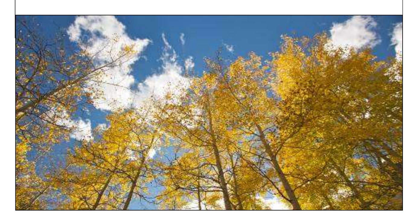
Restore, protect and/or manage 393 ha of land to improve water, air, soil, and habitat quality.