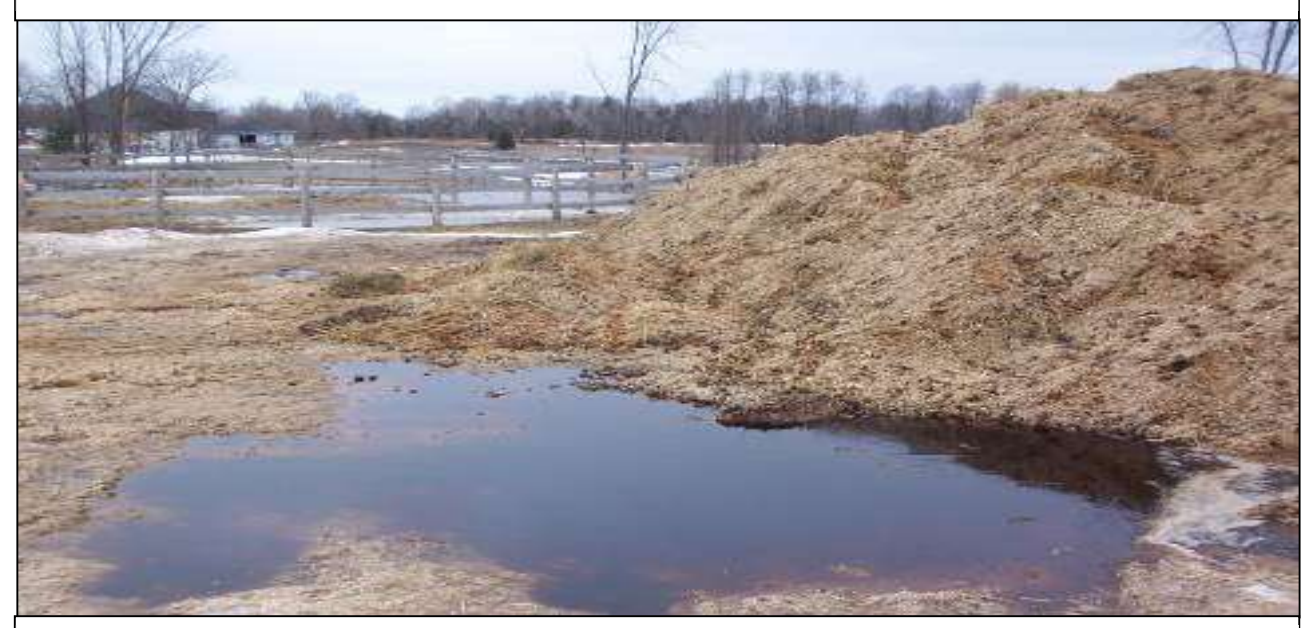
This equates to 47,161 dump trucks of manure!

Safely store 377,290m³ of livestock manure to reduce the risk of nutrient, pathogen and bacteria contaminating drinking water, streams, and wetlands.