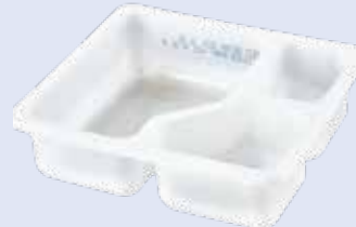
Lunch Mates™ (Tops are garbage)