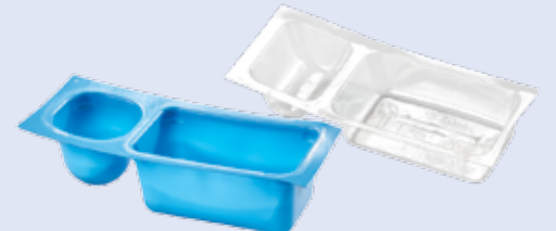
Hard plastic food containers (Tops are garbage)