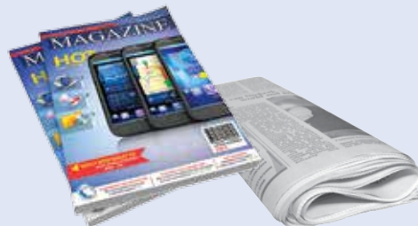
Magazines and newspapers