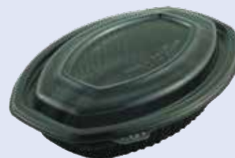
Plastic takeout containers