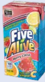
Juice boxes (Straws are garbage)