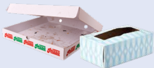
Cardboard (Remove plastic and food)