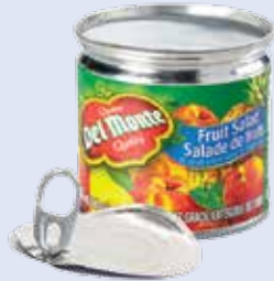
Metal food cans