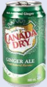
Metal beverage cans