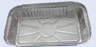
Aluminum trays (Lids are garbage)