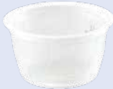
Applesauce and fruit salad cups (Tops are garbage)