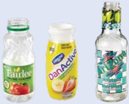
Plastic and glass bottles (Caps are garbage)