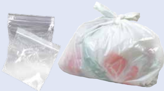
Plastic bags and baggies (Collect in one bag, tie shut)