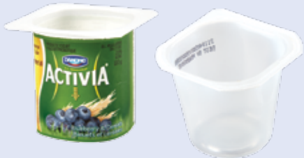
Yogurt and pudding cups (Tops are garbage)