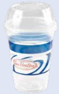
Plastic cups (Straws are garbage)