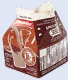
Milk and juice cartons