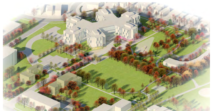
Preliminary concept rendering of the new Peel Manor seniors hub

This project presents a timely opportunity for the province to partner with the Region to advance its vision for person-centred long term care homes that are integrated with community supports, and inform innovative care models for the long term care sector broadly. The Region is calling on your support to help advocate the need for provincial support for this redevelopment of Peel Manor.