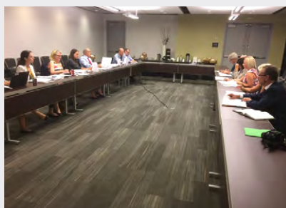
Peel's delegation meeting with Minister Bob Chiarelli.

Below is a list of Ministers that the Region of Peel Delegation met with as well as the issues that were raised at this year’s conference.