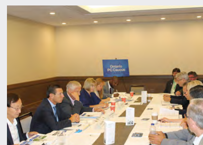
Peel's delegation meeting with Ontario PC Party Leader Patrick Brown.