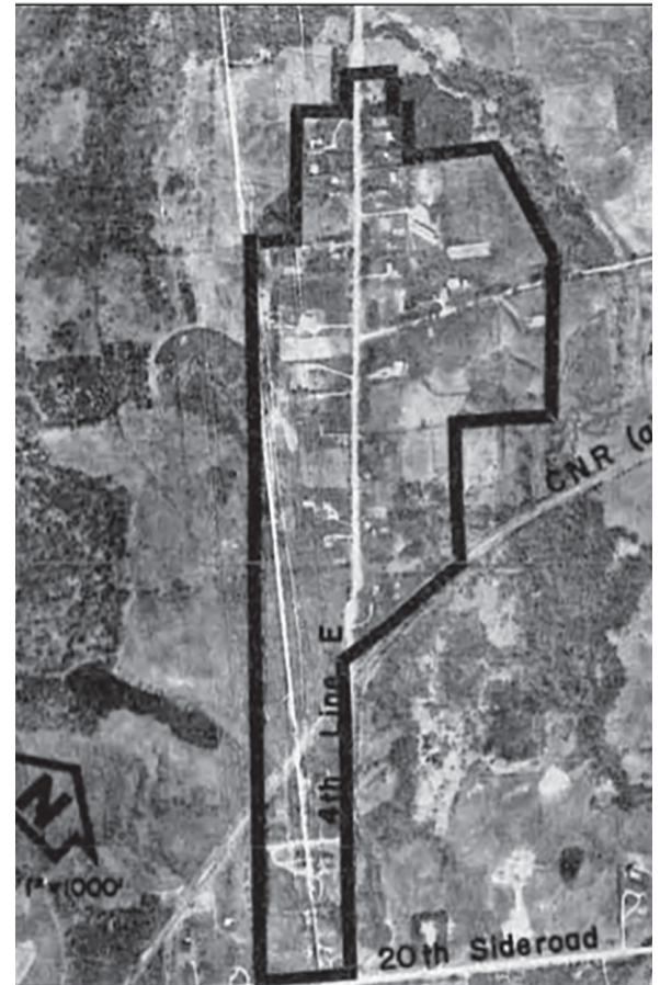
Town of Caledon Official Plan: Albion (Figure 2)

The updated mapping will help inform ongoing studies as part of the Peel 2051 process as well as provide a basis for updated mapping of rural settlement area boundaries in the Regional and Town official plans.